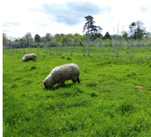
Sheep grazing apple orchards in April 2015