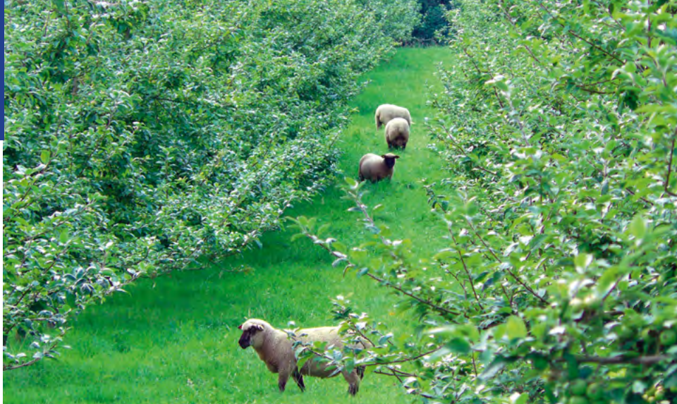
Apple grazed orchards in France Ref : N. Corroyer