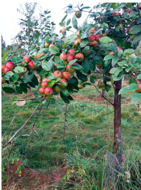
Impact of sheep on trees: attacked branches up to a height of 1 m Ref: N. Corroyer

Grazing in orchards appear to reduce the number of vole holes in the soil, but the long-term response still needs to be determined.